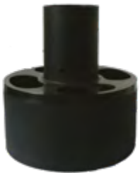
Flow reducer to prevent sedimentation turbulence in the tank