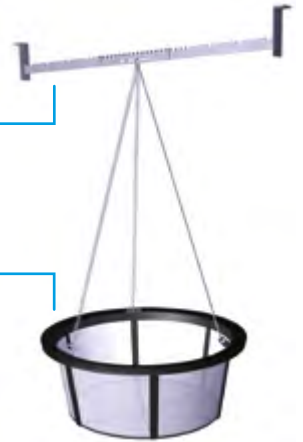
Filter basket with fine screen for suspension in the shaft