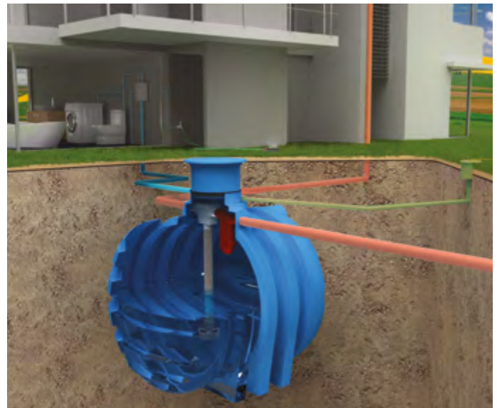
NEPTUN installed with inflow set