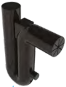
Overflow trap with rodent protection